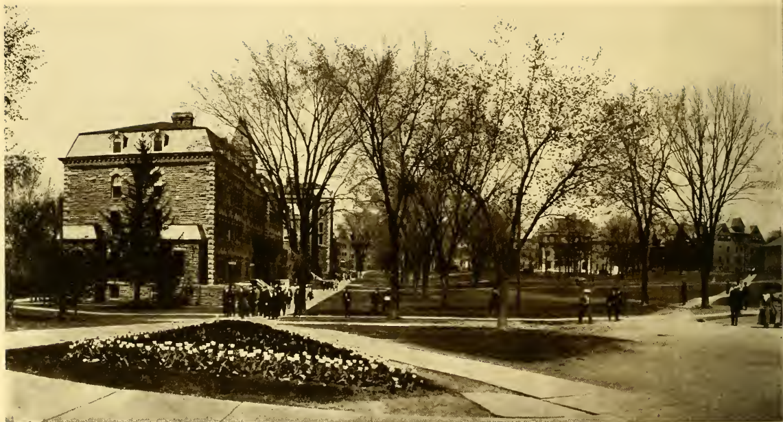
MORRILL HALL FRANKLIN HALL WHITE HALL McGRAW HALL